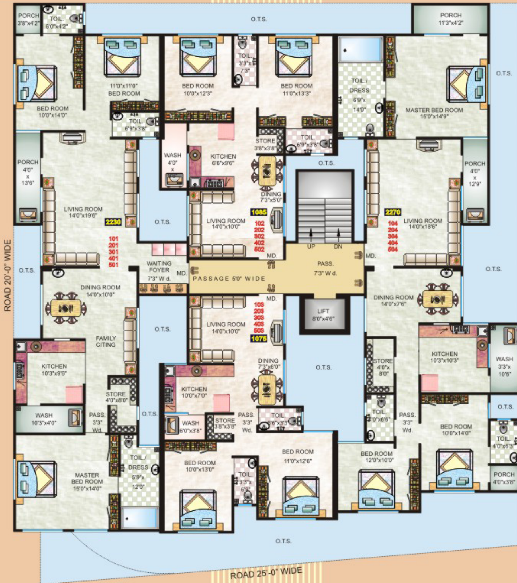
1st TO 5th FLOOR PLAN ( OPTION - 2 ) 3 BHK & 2 BHK PLAN