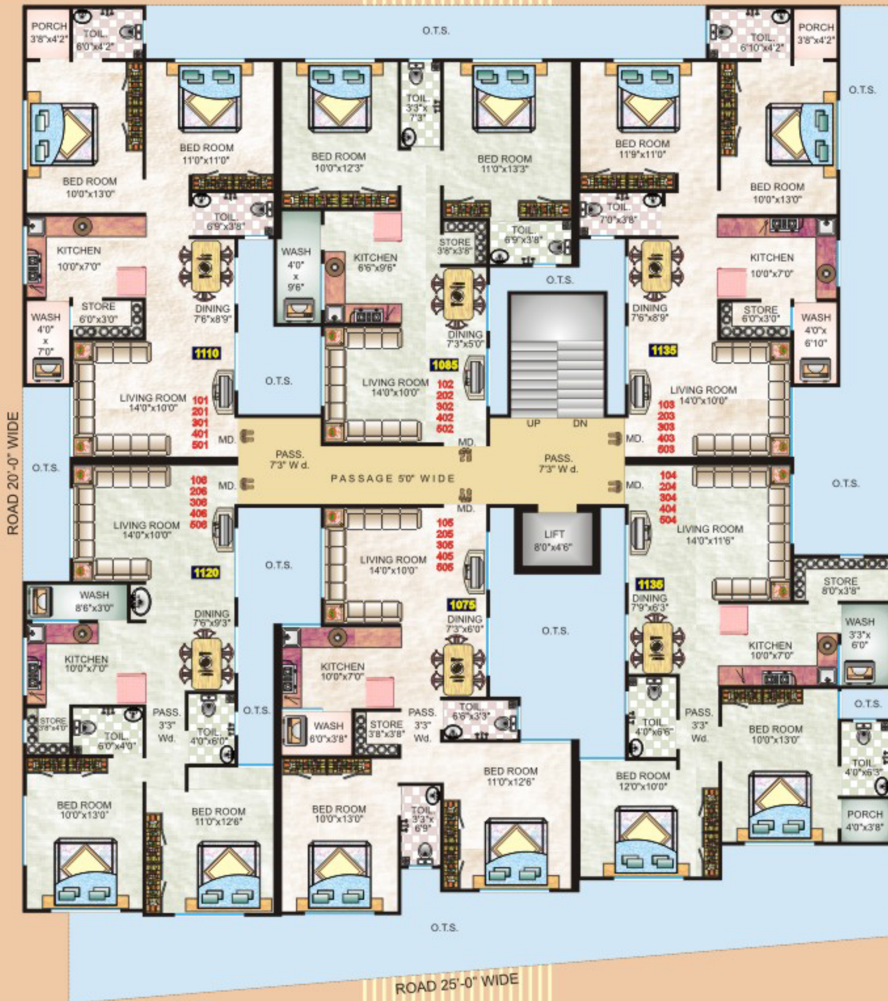
1st TO 5th FLOOR PLAN